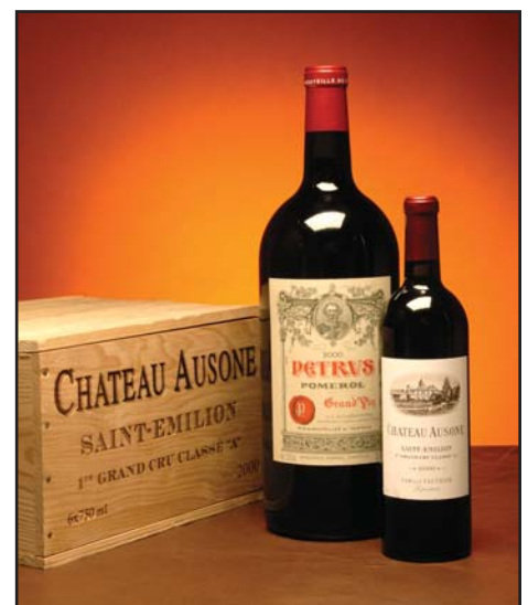
Lots 756, 748