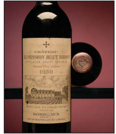
Lot 544 (June Sale)