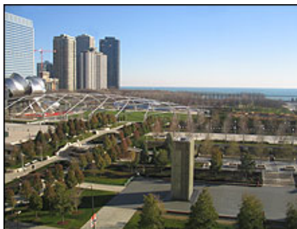
View from the Chicago Athletic Association.